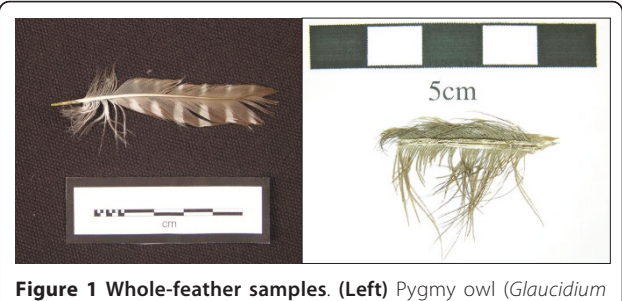
Figure 1 Whole-feather samples. (Left) Pygmy owl ( Glaucidium californicum ) feathers obtained from the SFU Department of Archaeology's zooarchaeological reference collection; ( right ) 200-year-old magpie ( Pica pica ) feather recovered from archaeological site near Kamloops, BC.

In all cases in which clear sequences were recovered, DNA sequences were either identical to or very similar to the published GenBank reference sequences for all